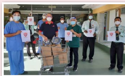
9/8, AOS delivered 2 sets air oxygen blender & flowmeter

Dr Wong Chong Yuen brought the good news that Perak Chinese Chambers of Commerce crowdfunded RM50,000 to purchase equipment for COVID frontlines, including PKRCs.