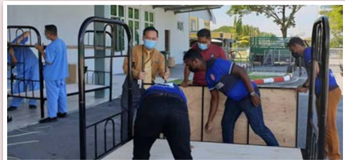
2/6, more beds for PKRC