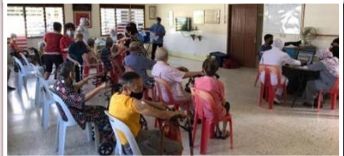
PH vaccination, senior care homes (20/5 & 28/5); Pangkor (27/6)