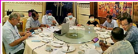
1/5, PMPS Committee at Maharaj Restaurant