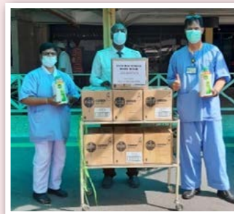
4/5, AOS delivered body wash to ED