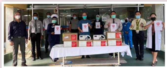
8/6, AOS delivered 6 units of syringe pumps