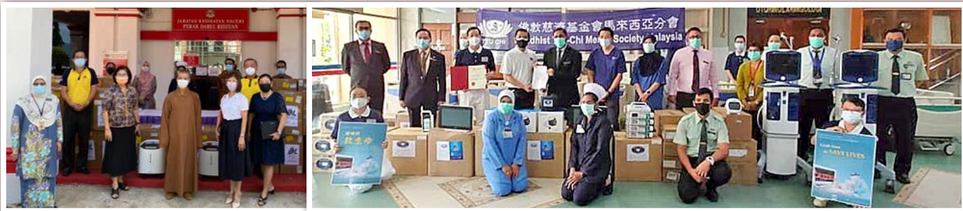
25/6, Tzu Chi Foundation donated oxygen concentrators and fully equipped ICU beds for Perak

Delta VOC invaded beyond Klang Valley, where hospitals neared collapse in early July. Their patients spilled over to SRH, which increased its ICU capacity. Perak's situation harshened. The oxygen crisis deepened with patients having to share oxygen ports. Categories 1 to 3 patients with co-morbid needed admission since they often deteriorate fast. More COVID wards opened.