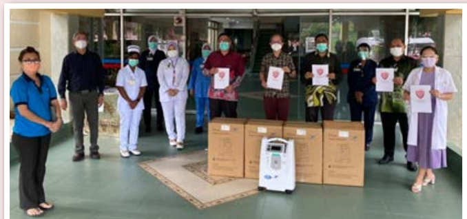
10/6, AOS delivered 4 oxygen concentrators