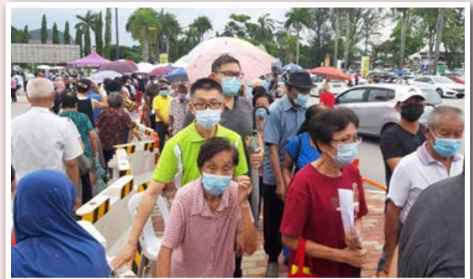
21/5, crowd at Indera Mulia Stadium PVC

Vaccination by Perak Public Health (PH) Team was stepped up in Public Vaccination Centres (PVCs) and extended to haemodialysis centres and senior care homes. Government sought help in vaccination from private sectors. 12 private hospitals (Selangor, Negri Sembilan, Sarawak) started doing so on 25/5.