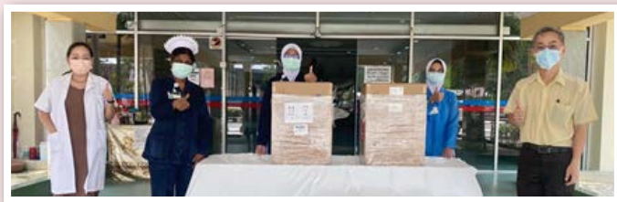
25/5, Dr Ko personally donated 2 oxygen concentrators – promptly used

Pusat Kuarantin dan Rawatan COVID-19 (PKRC) increased its capacity. The first of two drive-through PVCs started operating on 10/6. Mass screening in factories started in early July.