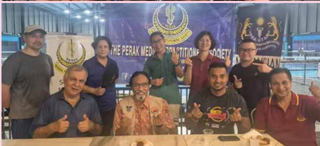
PMPS/MMA Doctors’ Day Pickleball