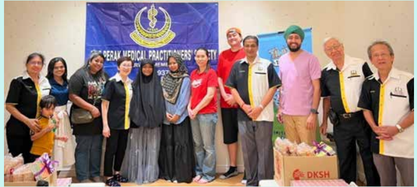
With the orphanage leaders